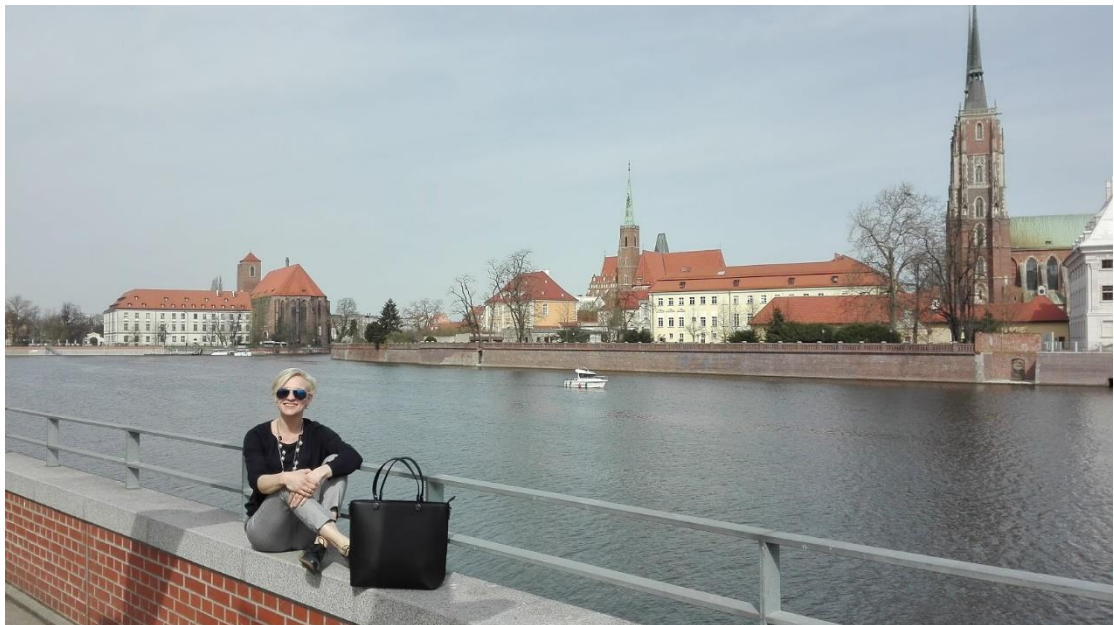
There are many beautiful churches in the city.