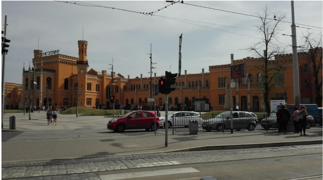
Wrocław Central Train Station.